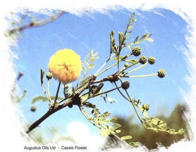
Augustus Oils Ltd - Cassie Flower